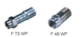
F 73 WP