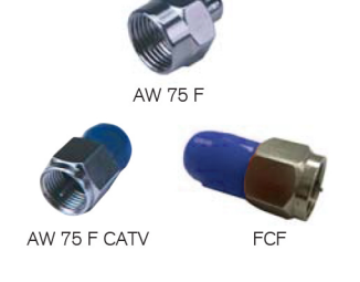
AW 75 F