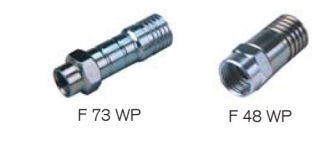
F 73 WP